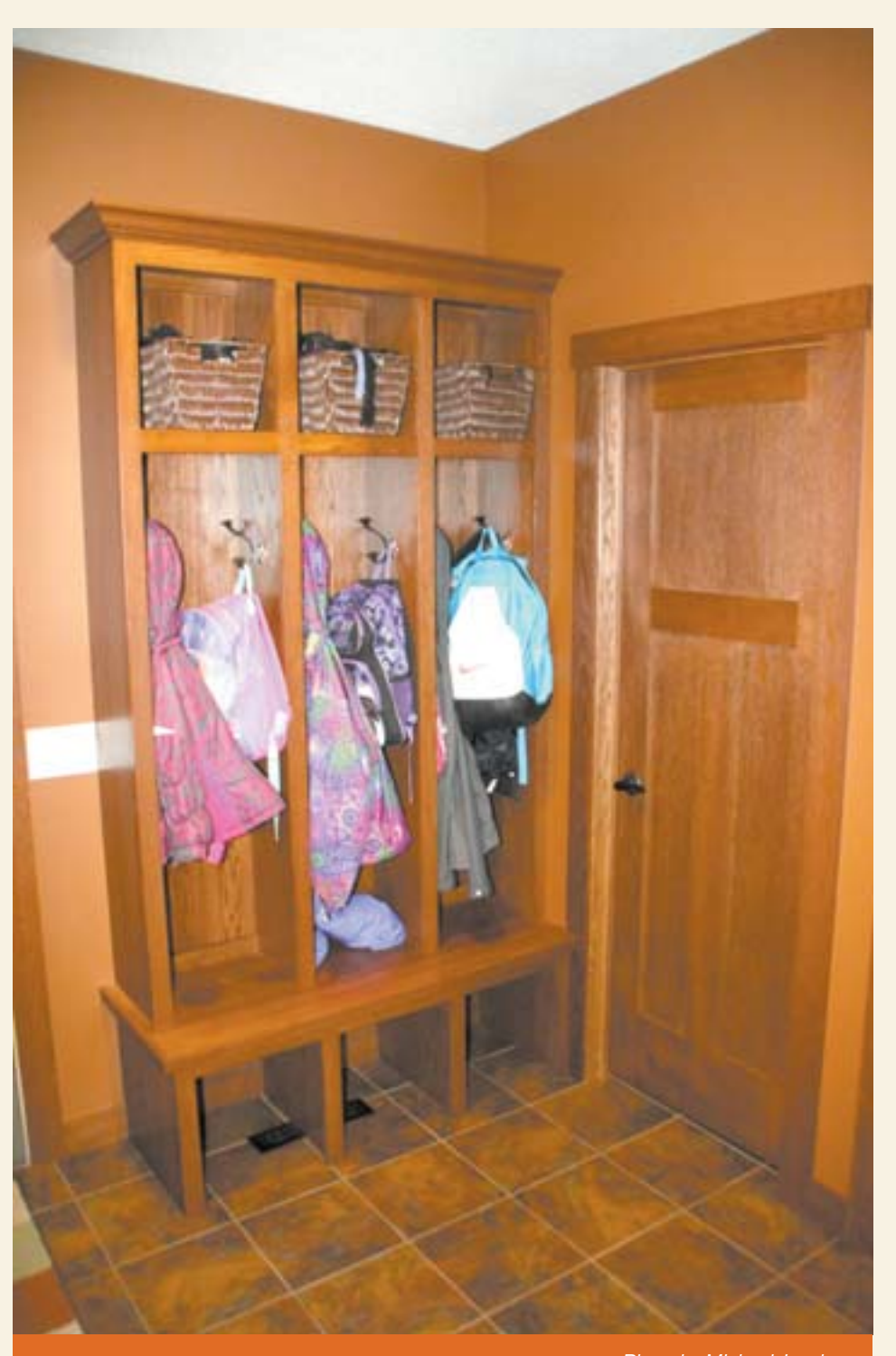
Matt and Shelly Helfenstein liked the flow of their previous house, especially the mud room (with cubby) off the garage with a walk-in closet (shown) and adjoining bathroom and laundry room (not shown).