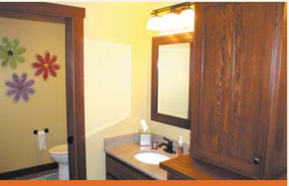
The upstairs bathroom is divided into two rooms: one with a double vanity and center cabinet (near) and the other with the toilet and shower (far).