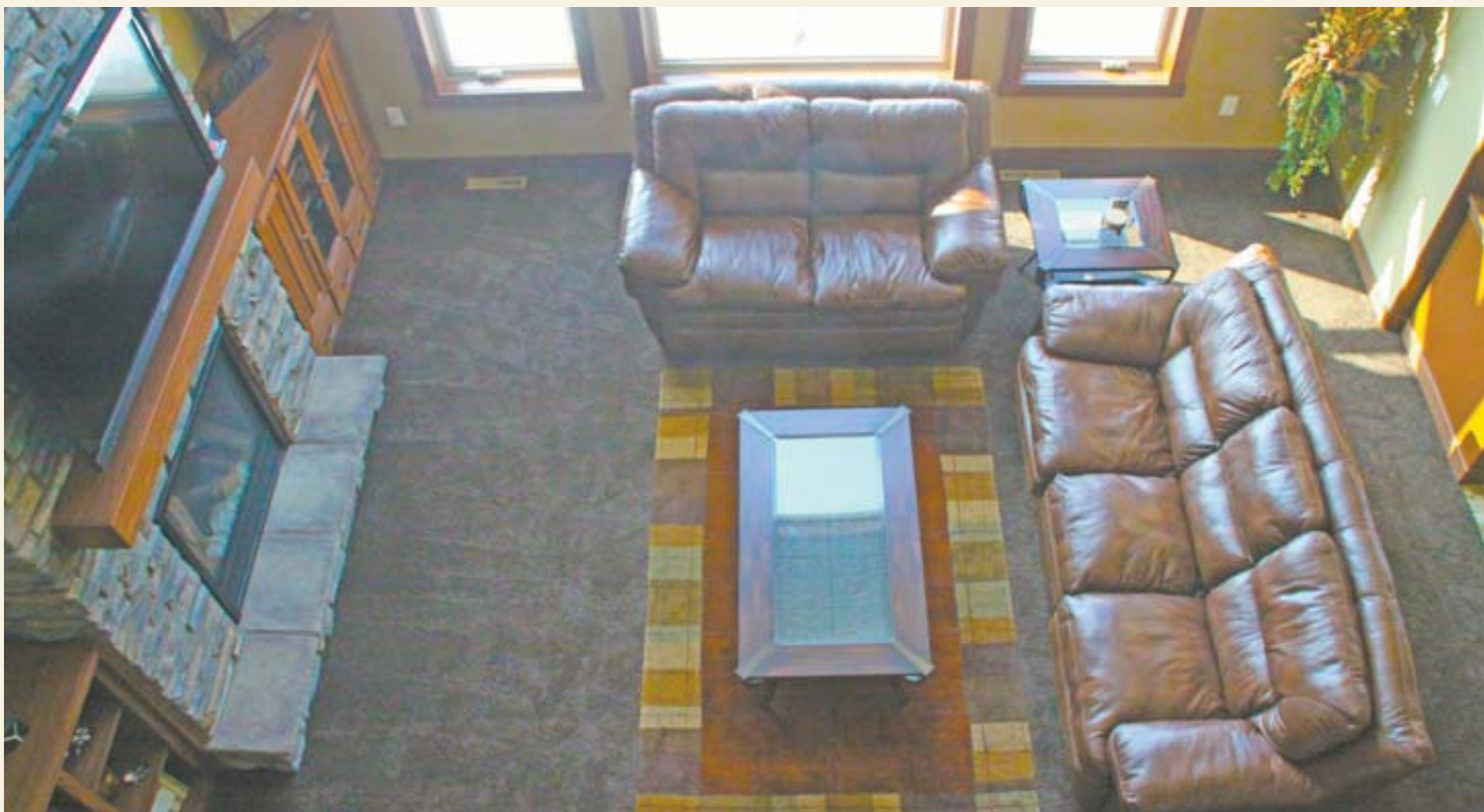
From the second-story balcony, there are views back down to the living room and out the two-story windows to the wetlands behind their house. In the distance, you can see the Horseshoe Chain of Lakes.