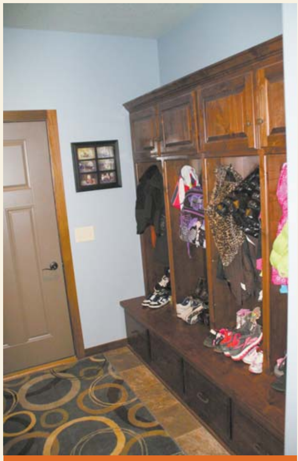
Their kids find the four-stall cubby – in the mud room off the threestall garage - to be very convenient for their jackets and shoes.