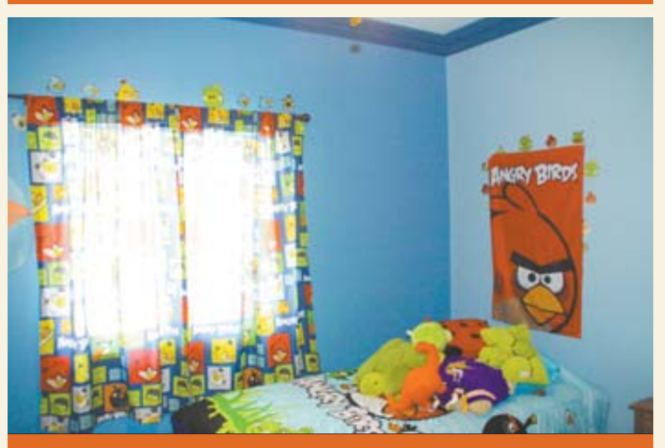
Their son's room is bright blue, and like his sisters's room it has a trace ceiling made by extra layers of sheetrock, also painted blue.