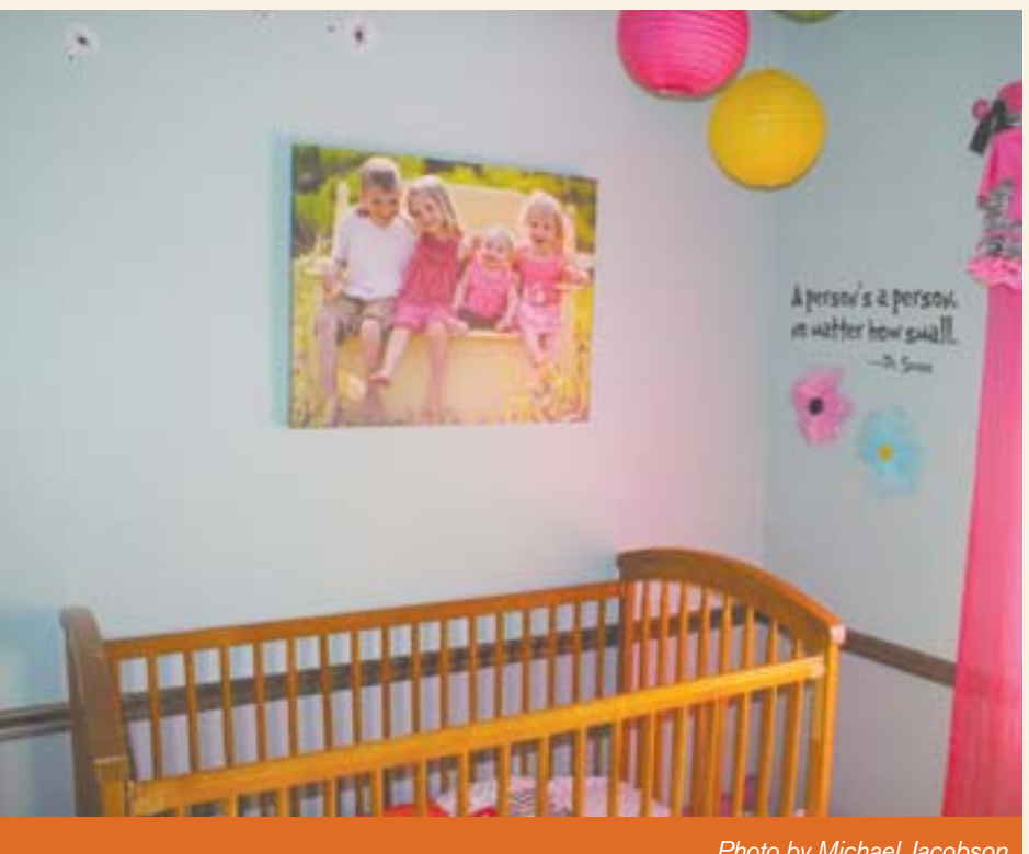
The nursery – currently used by their one-year-old – will eventually be turned into a home office.