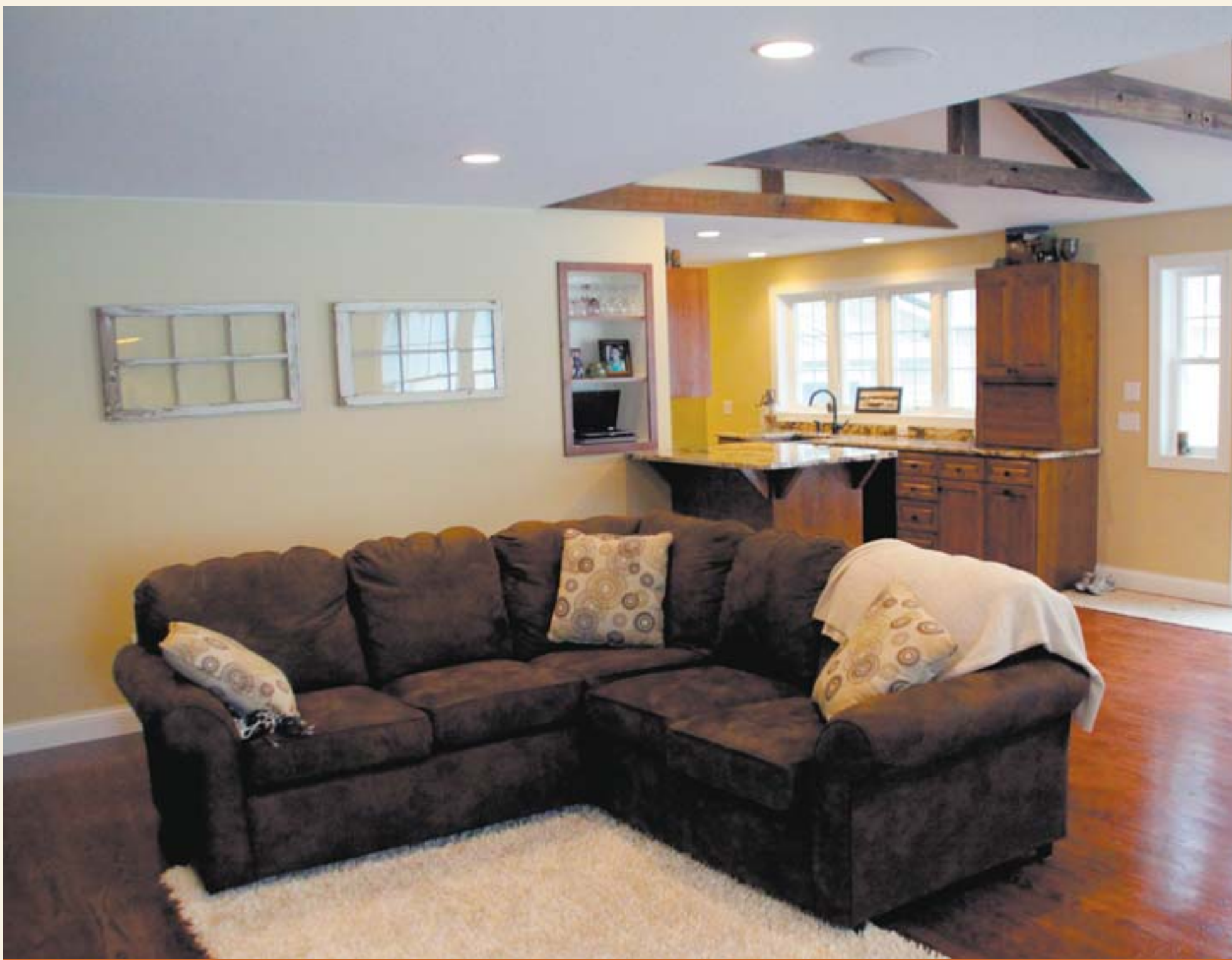
The Utsches wanted higher ceilings in their remodeled house, so they raised them in the great room and vaulted the ceiling over the entry and dining room.